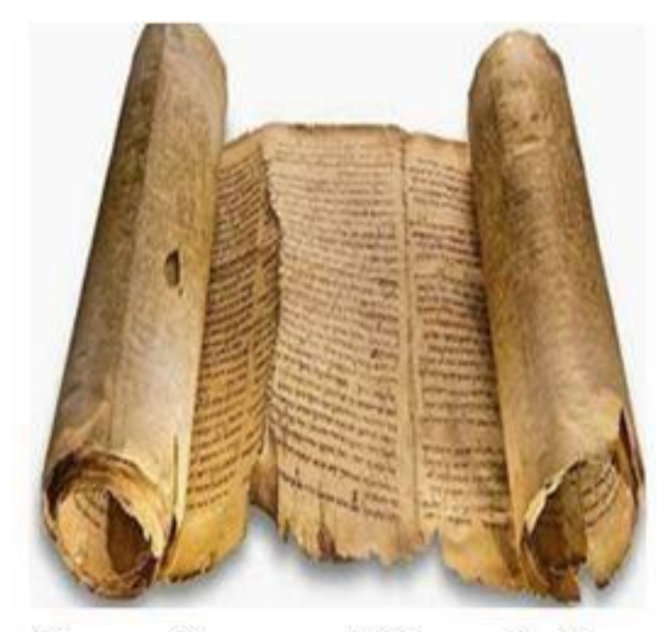
Compiling and Translating